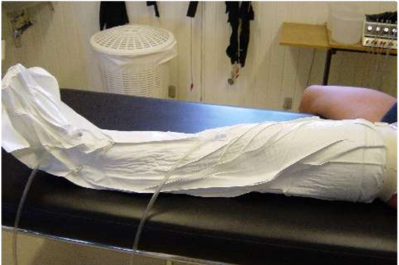
Successive Treatment with LargeBoot / LegBag P2-045 - 20 min.