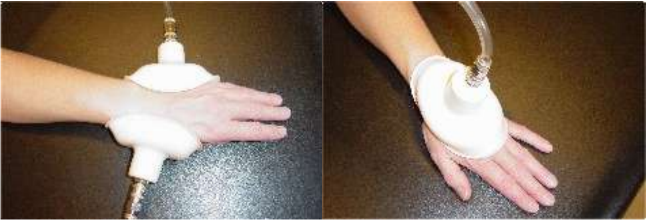
Treatment with Suction Cups P2 0,45 - 20 min.