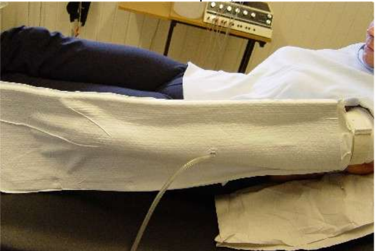
Successive treatment with armbag P 2 0,30 - 20 min.